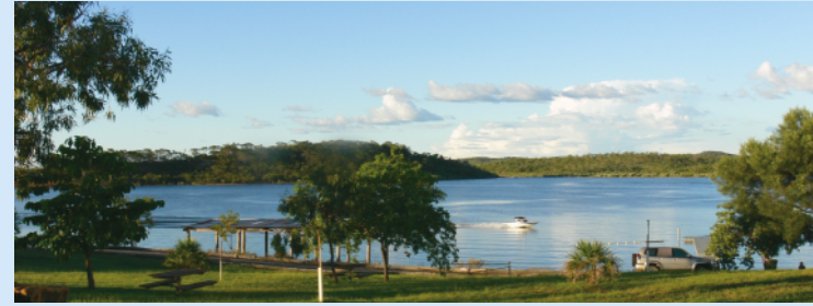
Lake Belmore is less than 4km from town.